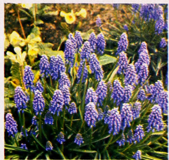
41 The Siberian Squill (Scilla siberica), at left, helps greet the new Spring season along with other minor bulbs, such as Iris reticulata, shown in the center. On the right is the well known Grape Hyacinth (Muscari), which blends so well with other Spring bulb flowers that appear in mid season.

During what is often called the "height" of the bulb-flower season, we find other members of this large group of minor bulbs bursting into bloom. Grape hyacinths (muscari) are the perfect companion for the trumpet daffodils, giving a deep blue to blend with the golden color of the larger daffodils.